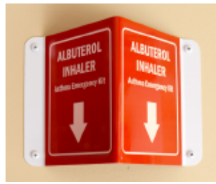
ALBUTEROL INHALERS Product Number: EN9342 Dimensions: 7" x 10" x 5"