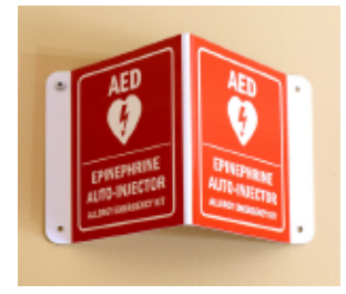
EPINEPHRINE & AED Product Number: EN9382 Dimensions: 7" x 10" x 5"