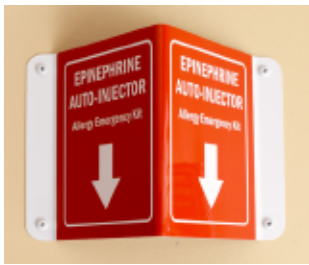
EPINEPHRINE AUTO-INJECTORS Product Number: EN9341 Dimensions: 7" x 10" x 5"