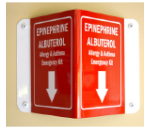
EPINEPHRINE & ALBUTEROL Product Number: EN9343 Dimensions: 7" x 10" x 5"