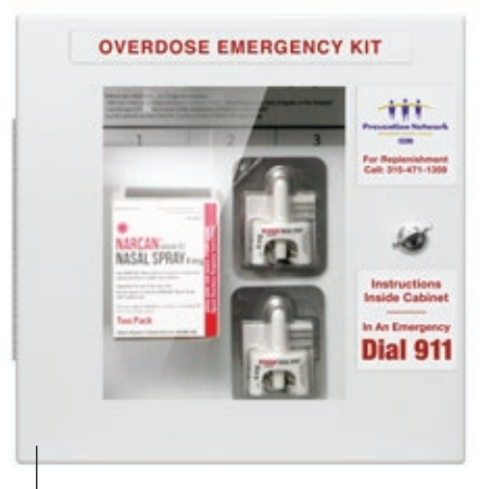
This cabinet was created for the Prevention Network in New York State.

Proposed design for Alcohol, Drug and Mental Health Board of Franklin County, OH public access Narcan strategy.