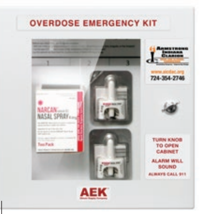
Armstrong-Indiana-Clarion Drug & Alcohol Commission uses this cabinet in their Public Access Naloxone program.

This Nyxoid Cabinet was created for the Government of Western Australia for their locally available brand of Naloxone.