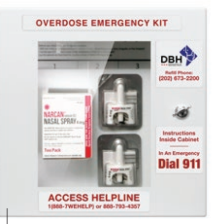
This design was created for the Washington D.C. Department of Behavioral Health.