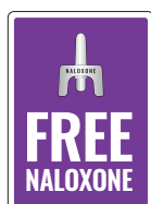
Bottom Stickers 6"x 8.25" (x2)