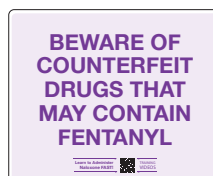
Bottom front sticker 9.5"x 8"