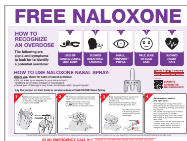
Window: 17"x 12.5"