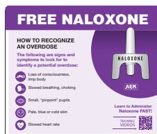
Side Middle Stickers 10.5"x 8.5" (x2)